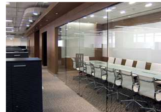
Roche Thailand Ltd. by Practika