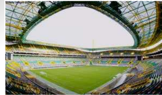
Alvalade Stadium by Martifer