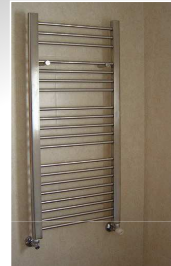
Towel radiators by Foursteel