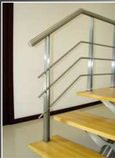
Handrails by Inocambra www.nsmaquinas.pt