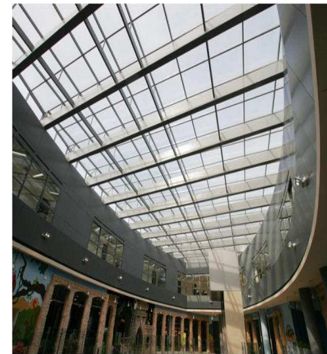
Beirut Mall by GlassLine Industries