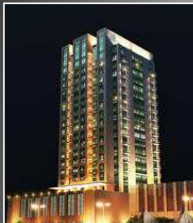
Hamilton Tower, Dubai by GlassLine Industries