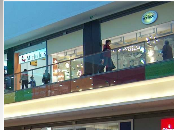
Shopping Center Dolce Vita by Martifer