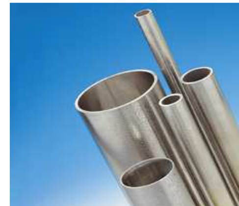
Tubes wholesaling by BTH