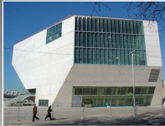
Casa da Música in Oporto by Inoxave