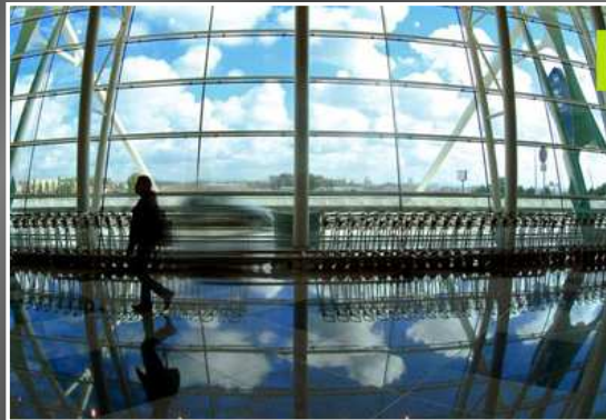
Oporto International Airport by Martifer