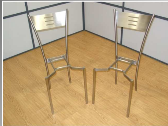
Decorative furniture by Inoxave