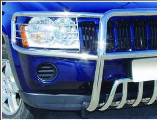
Off Road Bull Bars by Tal & Hadas