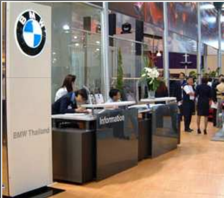
BMW Company Thailand by Practika